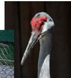
◀ Lady, our sandhill crane has a new life as a permanent resident at SOS and is an inspiration to us all.