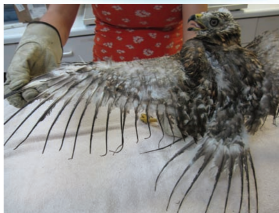
Sparky, our singed red-tailed hawk, continues her recovery. Her feet are healed although it will take 10 to 12 months for her feathers to regenerate.

Save Our Seabirds recently received a red shouldered hawk with all of its feathers singed off. Also, her tail feathers were gone and her feet and some of her down feathers (getting ready for winter) were slightly singed. Having not encountered a bird in this condition before, we investigated further. Because of her location when found at a landfill near a methane gas burner, we concluded she must have flown over one of the burner stacks.