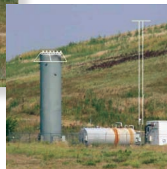
Pictured Left: The height of the methane burner stack (60 ft) makes an ideal perch for raptors waiting for their prey.