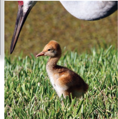
◀ A baby sandhill is cared for by Lady.

nature shown through so that she became known eventually to everyone as Lady. After a month of massage, rest, and physical therapy she was able to hold her head up and take a few steps. She gradually recovered.