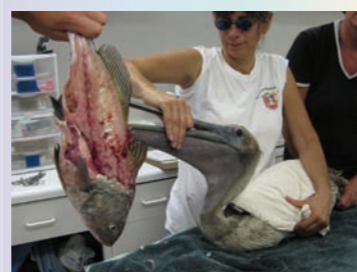
Four people worked to get this fish carcass out of the throat of the pelican.

Some of the most dangerous items to safely discard are plastic six-pack rings, fishing line, hooks, discarded fish carcasses and fish scraps. Six-pack rings can strangle a bird and prevent them from digesting their food, dying from rotting carcass toxins lodged in the bird's throat causing a slow death from starvation and dehydration. Fishing line and hooks cause internal and external injuries maiming them and even death. Discarded fish scraps also lodge in the throat.