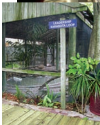
▲ New boardwalk sign.

executive director of Save our Seabirds, opening the newly restored boardwalk, aptly named Leadership Sarasota Loop. One of the many projects undertaken by the