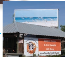
▲ New entrance sign.