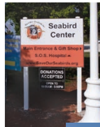
▲ New turnoff sign.

executive director of Save our Seabirds, opening the newly restored boardwalk, aptly named Leadership Sarasota Loop. One of the many projects undertaken by the